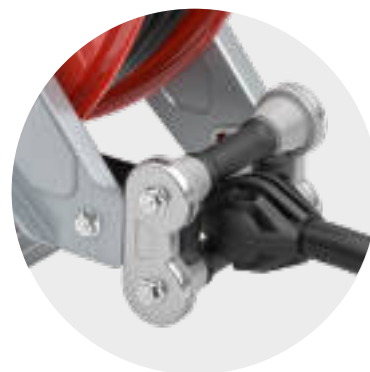
4R - Optional 4-roller hose guide. Ordering the version indicating the hose reel code followed by "4R" 4R - Guida tubo a 4 rulli opzionale. Ordinare la versione indicando il codice dell'avvolgitubo seguito da "4R"

EN Automatic hose reels suitable for the distribution of fluids at different pressure and temperature conditions. The parts in contact with the fluid have metal details and high-quality gaskets. Hose-guide arms adjustable in three different positions according to the hose reel installation (pos. A-B-C). Optional: connection hose, lateral protective covers (not available for mod. Atex), revolving stand, 4-roller hose guide, fixing bracket.