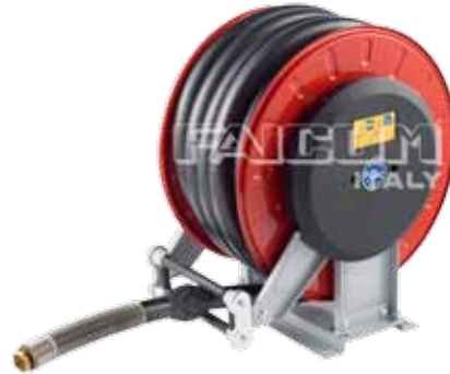
Spring side with guide-hose arms in "C" position Lato molla con bracci guida tubo in posizione "C"