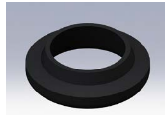
Replaces the standard BEX O-Ring

For installing BEX K-Ball clip-on nozzles into holes drilled to a 21/32 diameter.